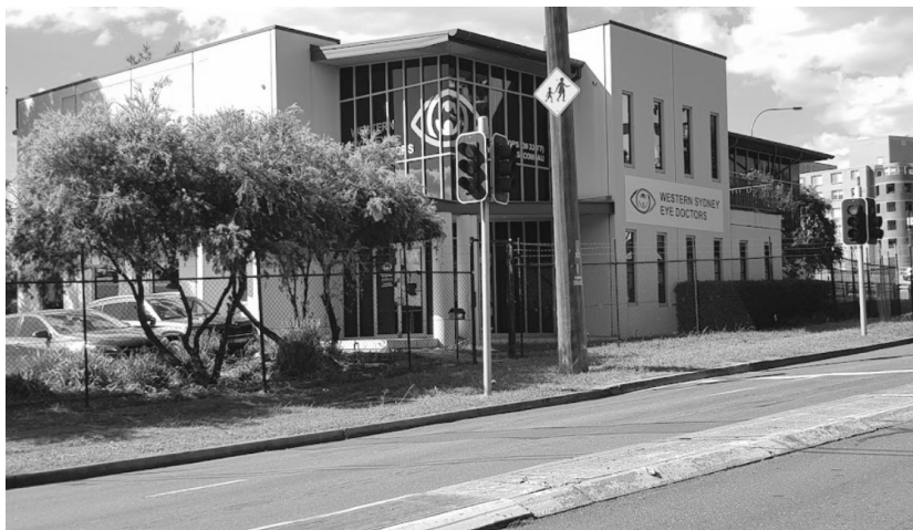
Western Sydney Eye Doctors 25 south Parade, Auburn 2144